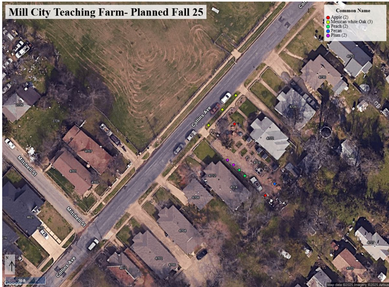
Figure 5 Photo shows trees and pollinators that will be planted in Phase 2 in Fall 2025. Future connections should be installed for these 10 trees as part of the scope of work in Summer 2025.