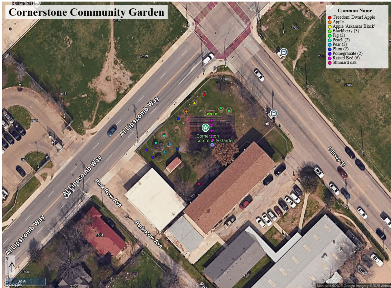
Figure 2 Site 1- Cornerstone Community Garden. Site plan shows 14 trees, 1 fruit/veggie trellis (blackberries), and 6 raised beds.