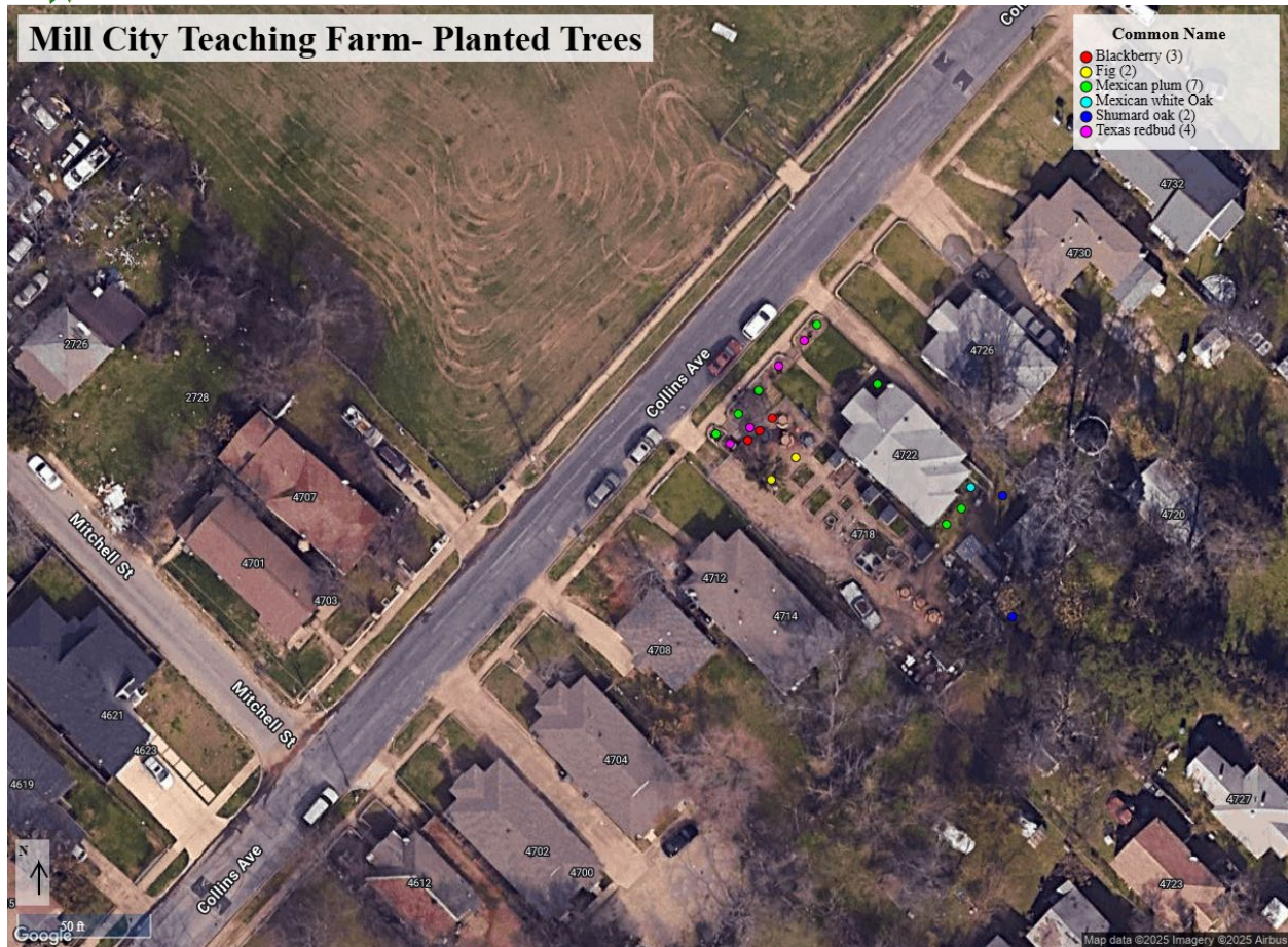
Figure 4 Photo shows 16 trees (excluding blackberry) planted in phase 1 that will receive bubblers and 16 raised beds that will receive drip irrigation in Summer 2025.